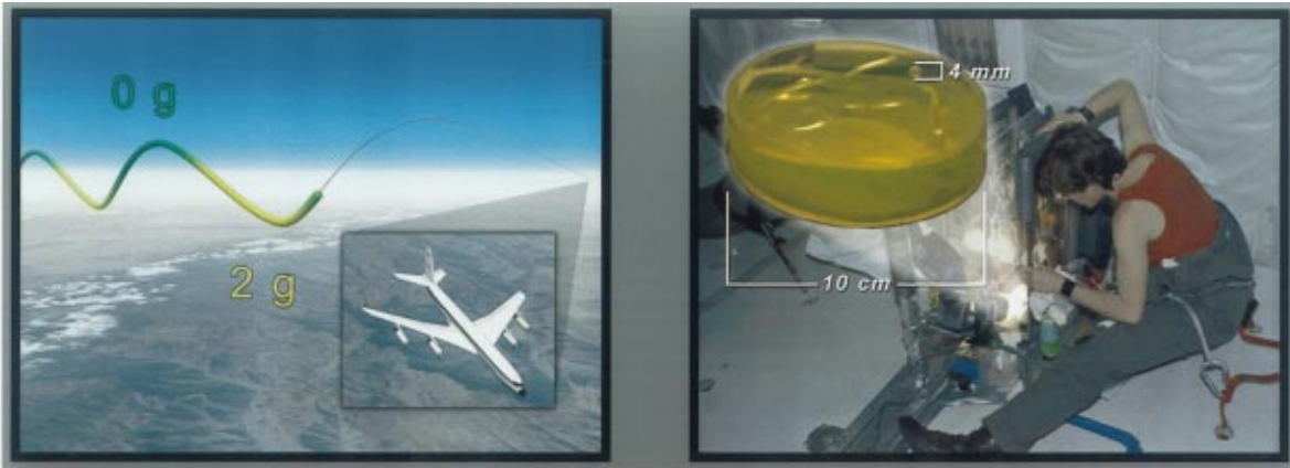
Time Progresses from Left to Right for all Panels