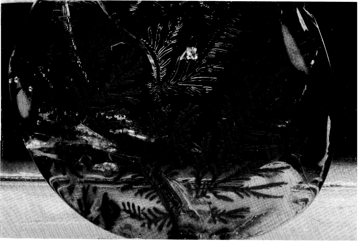
FIGURE 2. Viscous fingers in a chunk of amber. It has appeared in the National Geographic Magazine in September 1977, pp. 434–435. To quote from the accompanying text by T. J. O'Neill, 'apparently a tiny crack developed in an already solidified lump of resin; fresh, sticky resin then began to fill the narrow crevice. Air also crept along the fracture plane, thus forming the array of mosslike pseudo-fossils. Some foreign substance – perhaps iron oxide – [provided color]' ... 'The classical Greeks called [amber] electron .' ... 'Not until when the Roman author Pliny made public his Historia Naturalis , was amber scientifically described as a product of the plant world.' Not until fractal geometry had become available, could the 'array of mosslike pseudo fossils' be recognized as an example of viscous fingering, and could become an object for quantitative study.